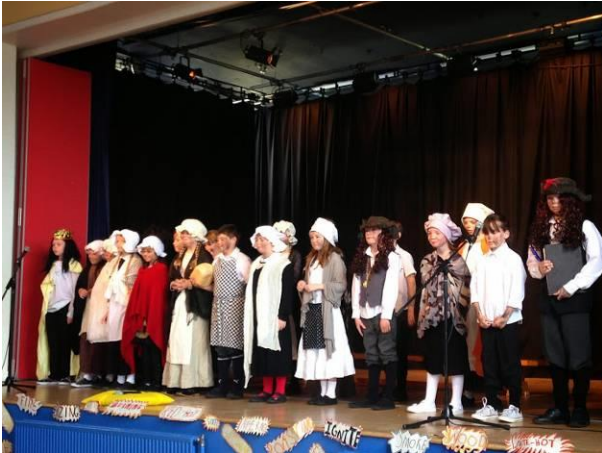
P5 reporting on their learning about the fire of London

There are also lots of opportunities throughout the session for parents to come up to the school and see for themselves learning in action. Each class takes responsibility to showcase their learning at an assembly and many of our classes enjoy showing learning from an interdisciplinary topic in the class.