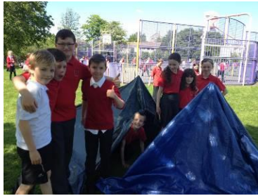
Problem solving in the sun

Learning takes place in and out of the school. Before our new building was started we had extensive grounds which were used to full advantage. Eventually we will have the grounds back – we can't wait!