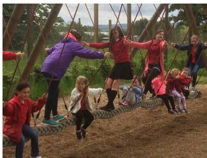
Having fun together at the Safari Park

Educational visits take place to enhance children's learning. These include part day visits within the local area, day visits further afield and residential visits for our Primary 7 children. Last year the whole school visited the Safari Park – educational and lots of fun!