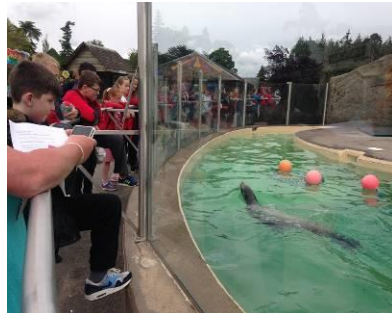
Learning about animals

From Primary 1 through to Primary 7 we aim to give our children a wide variety of learning experiences in and out of school. It would be impossible to write about them all here. For more photographs and information on our curriculum please visit our web site – www.halfmerke-pri.s-lanark.sch.uk .