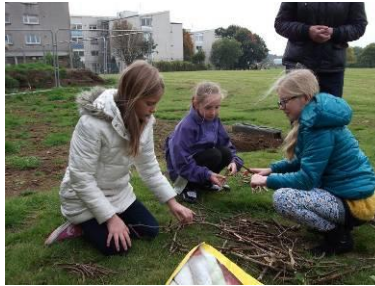
cooking by fire

Educational visits take place to enhance children's learning. These include part day visits within the local area, day visits further afield and residential visits for our Primary 7 children. Last year the whole school visited the Safari Park – educational and lots of fun!